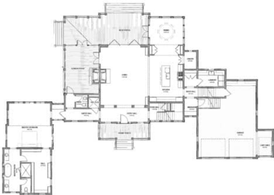
Floor Plan - 1st Floor