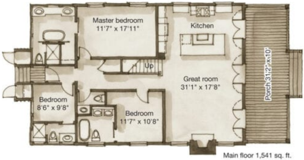
Floor Plan - 1st Floor