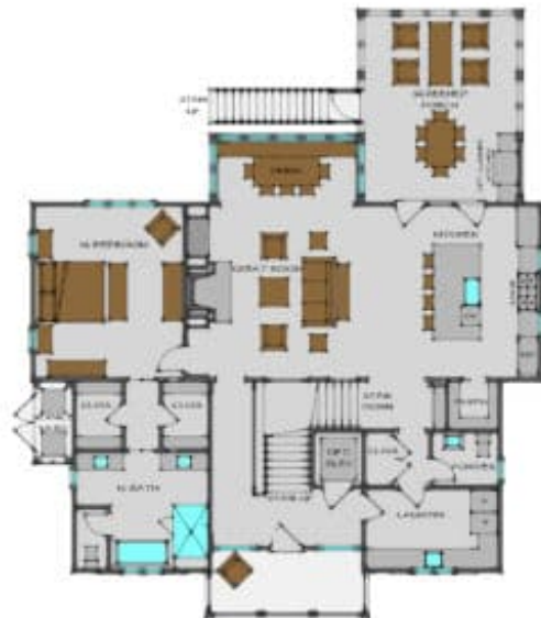
MAIN LEVEL PLAN